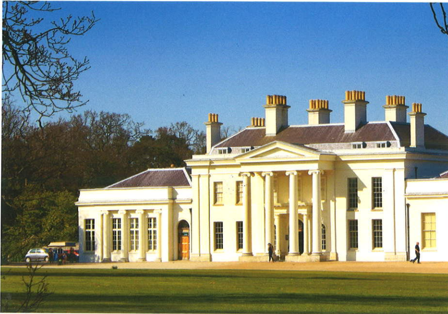
CHELMSFORD CITY COUNCIL

Connecting, developing, promoting and supporting thriving, caring communities